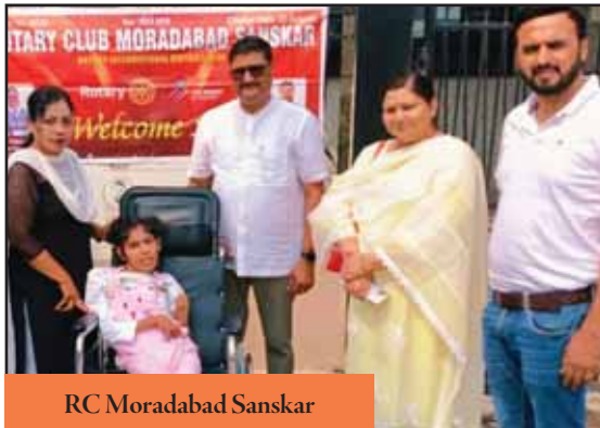
RC Moradabad Sanskar