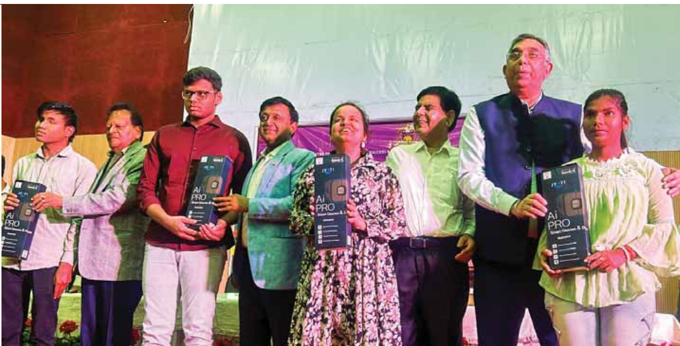
Beneficiaries receiving the AI smart glasses from Rotarians.

visually-impaired individuals.” The project, with a total cost of $42,500, was supported through a CSR contribution of $27,000 from Ferolite