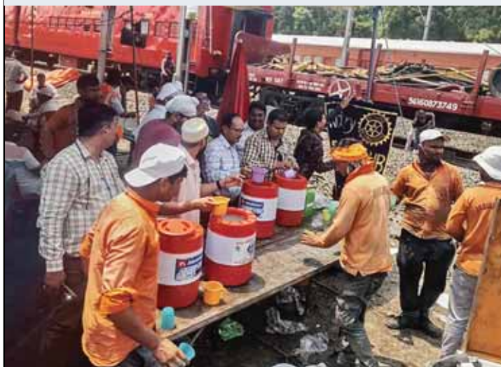
Rotarians distribute refreshments to Railway workers at the accident site.

In a show of community support, RC Amalner, RID 3030, provided water and raw mango juice ( keri panna ) to around 700 Railway workers engaged in the restoration of railway tracks, signalling systems and high-tension power lines in the aftermath of a train accident that disrupted rail services.