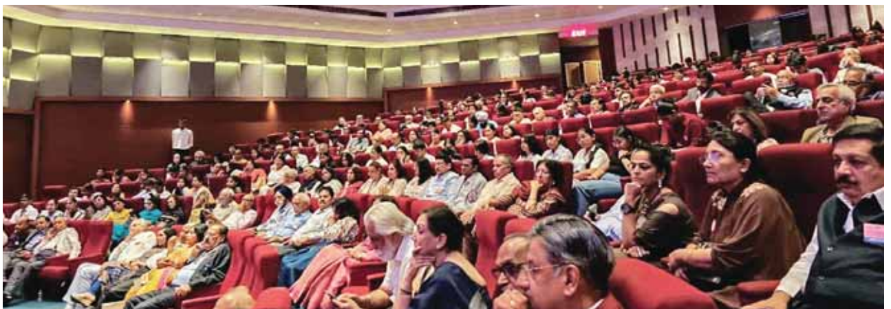
A section of audience at the seminar.