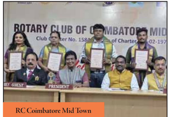
RC Coimbatore Mid Town