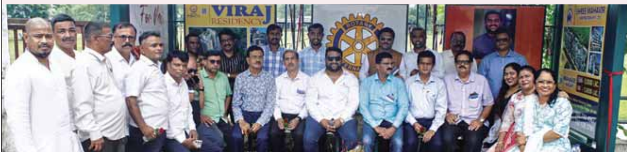
Rotarians at the newly-inaugurated bus stop shelter in Umroli.