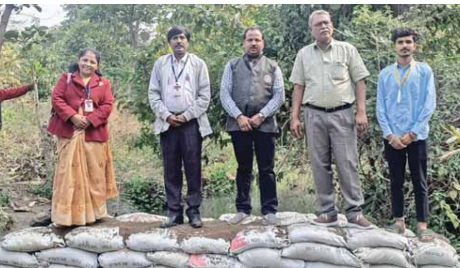
Rotarians at the check dam site in Krishnapur village.