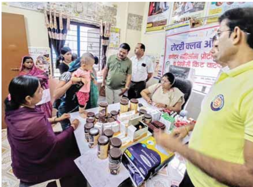
A medical check-up in a village.