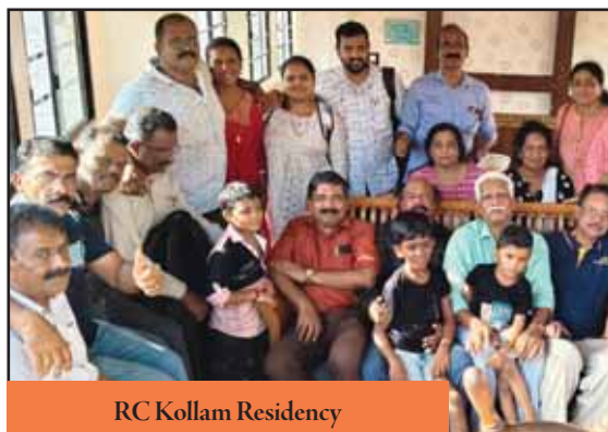
RC Kollam Residency