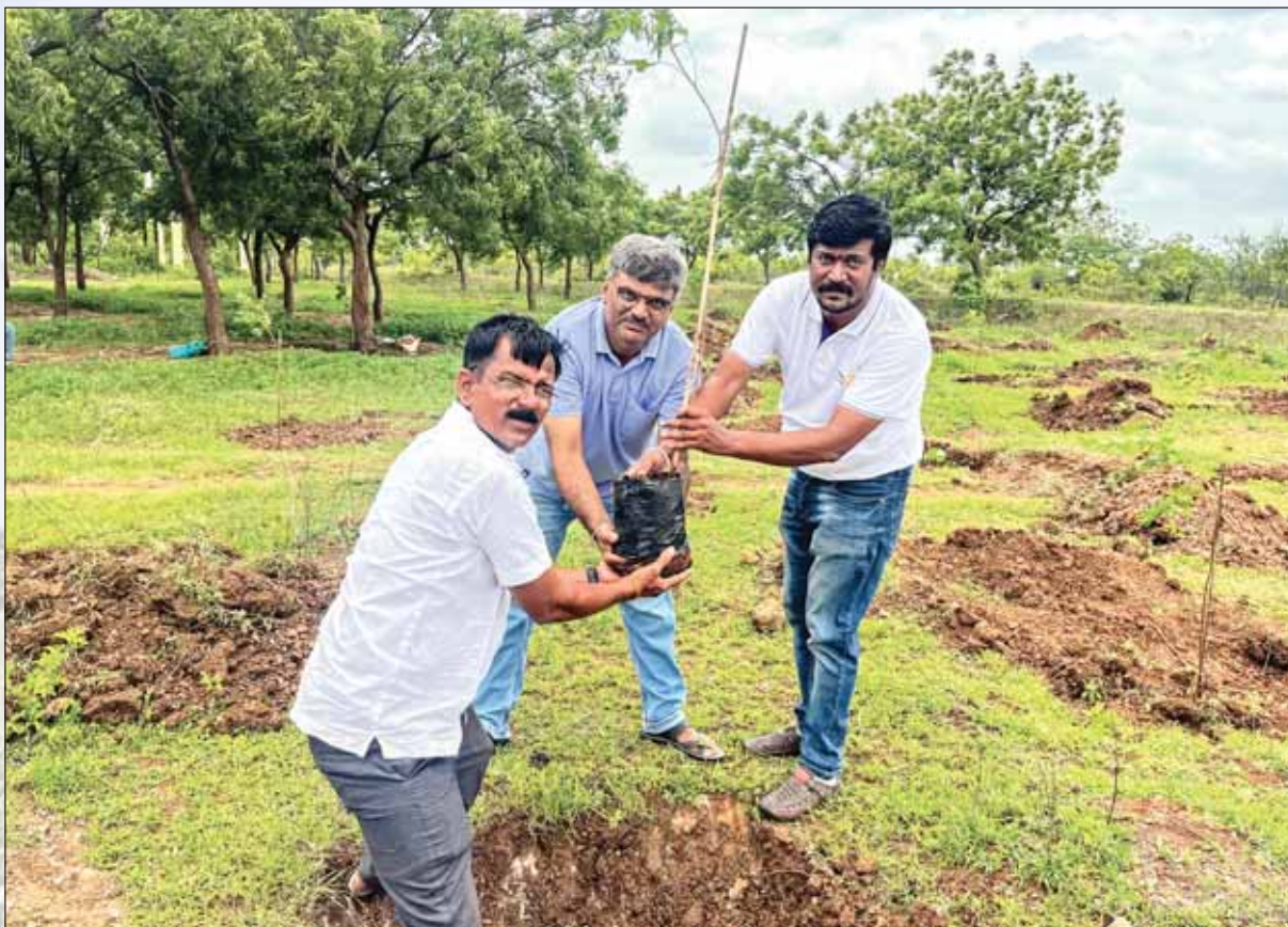
Club members plant saplings.

A s part of its ongoing efforts in protecting the environment, RC Solapur Smart City, RID 3132, in collaboration with Gulwanchi Gram Panchayat, launched the first phase of its mega tree planting initiative which aims to plant over 500 saplings. The drive began with the planting of 100 saplings at Gulwanchi village in June this year.