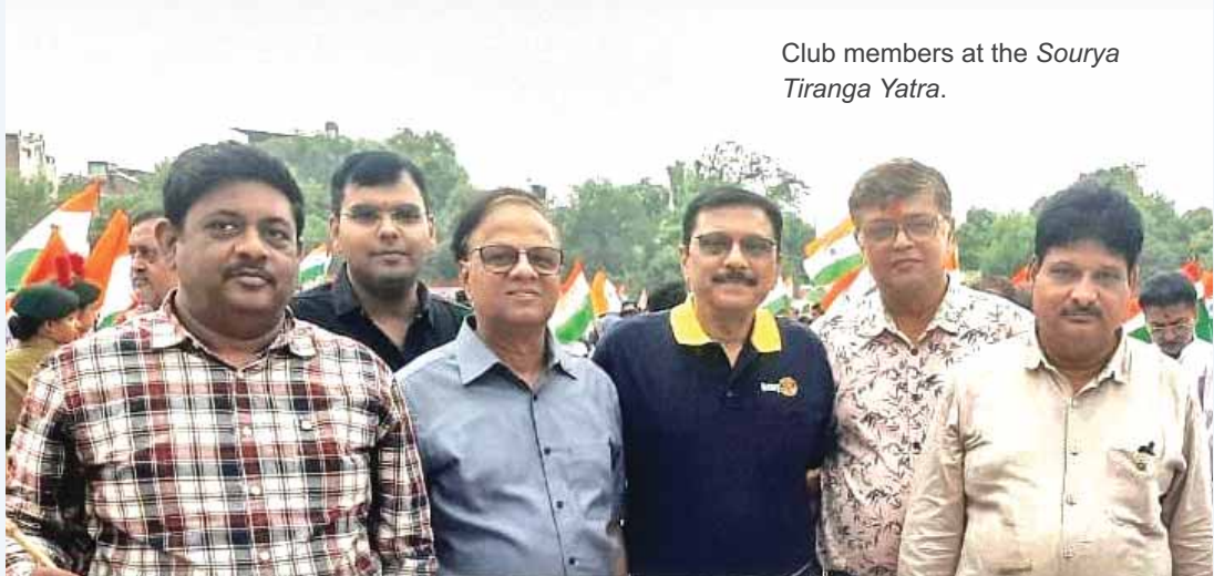
Club members at the Sourya Tiranga Yatra .

Vishwavidyalaya in Varanasi, was joined by several Rotary clubs. The yatra recognised the military's decisive response and their continued efforts to strengthen national security, thus boosting the public image of the club in this historic city. ■