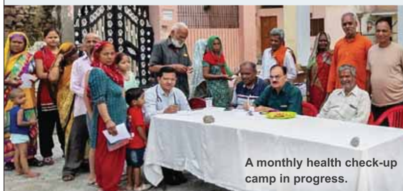
A monthly health check-up camp in progress.

Recently, a tree planting drive was held with the participation of large numbers of Rotarians in which fruit-bearing and native trees were planted, and the event was widely covered in the local newspapers. ■