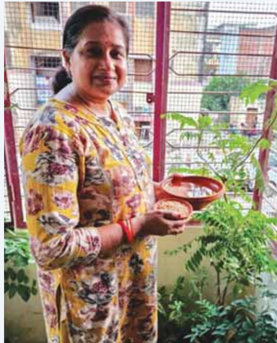
A club member placing food and water in her balcony to help birds survive the intense heat.

The club also participated in the Sourya Tiranga Yatra , a patriotic rally organised in support of Operation Sindoor, the military offensive in response to the recent terror attack in Pahalgam. The rally, held from Kashi Vidyapith to Sampurnan and Sanskrit