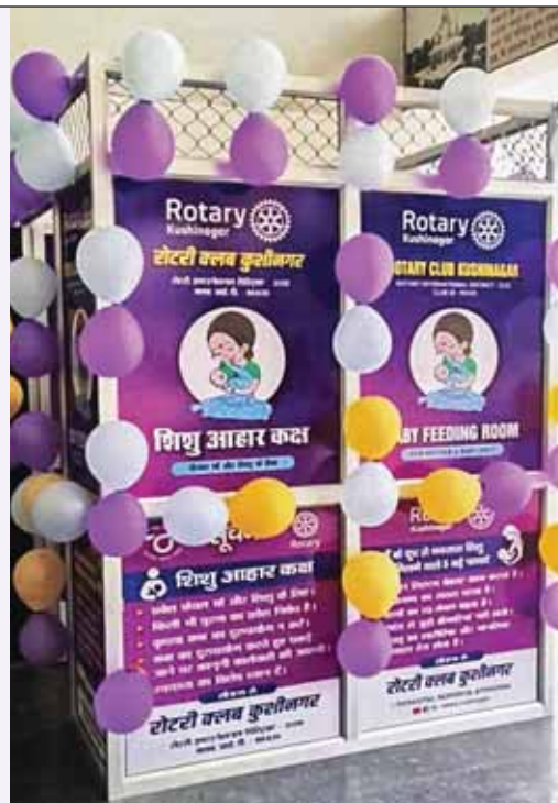
The new baby feeding room at the Kasia Roadways bus station at Kushinagar.