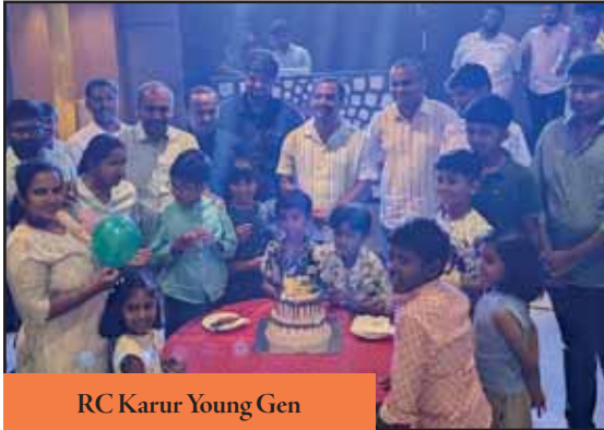
RC Karur Young Gen