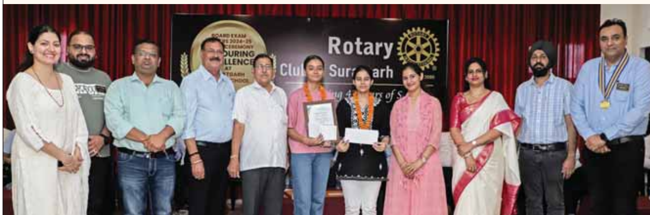
Students being felicitated by club members.

R C Suratgarh, RID 3090, organised a special award ceremony at Suratgarh Public School to honour 100 students from 30 schools across the city for securing top positions in Class 10 and 12 board exams (2024–25).